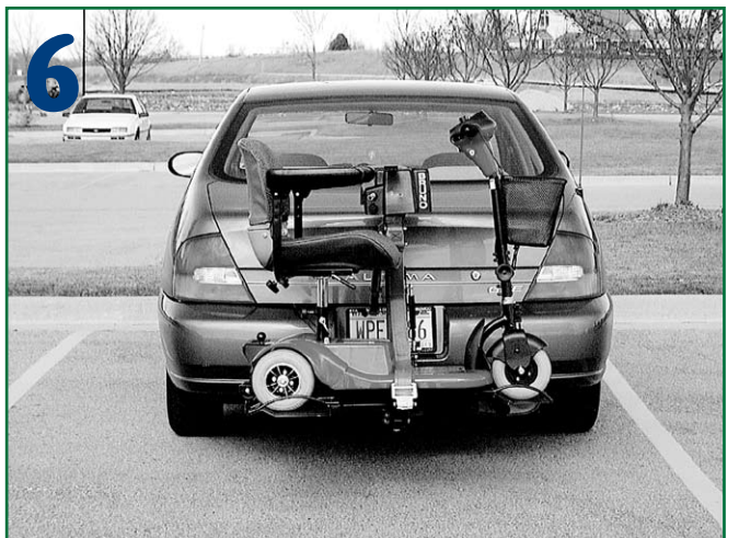
Lower lever, secure belt to Velcro®*, turn key to OFF and remove key.

*Velcro® is a registered trademark of Velcro Industries B.V.