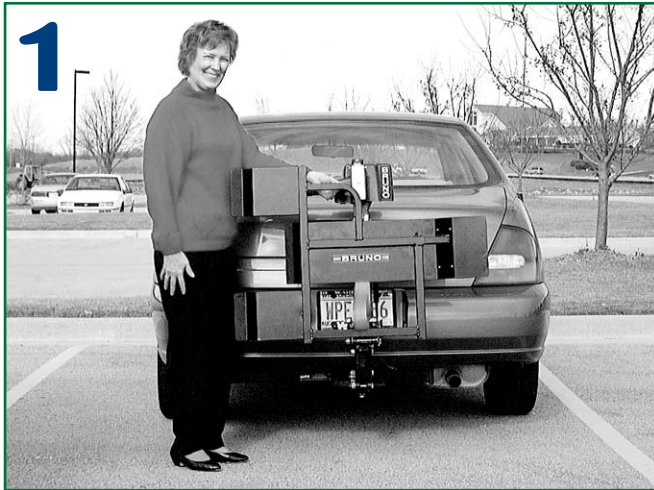
Insert key, turn ON and lift tab.