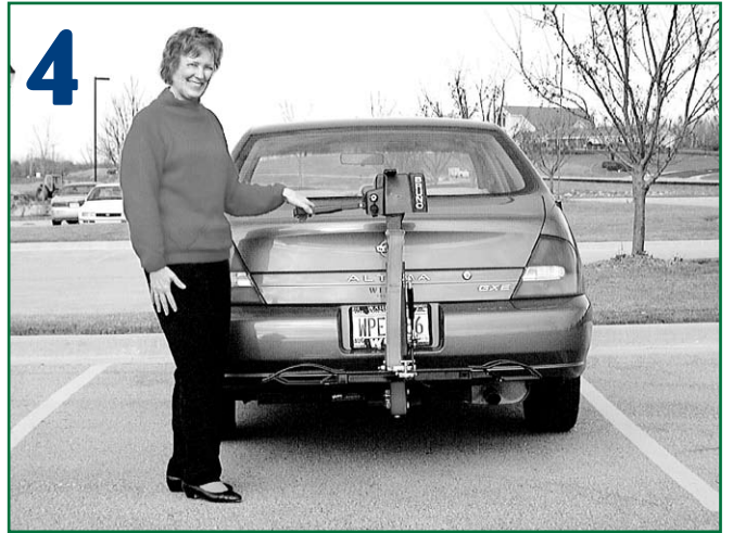
Press switch to lower platform.