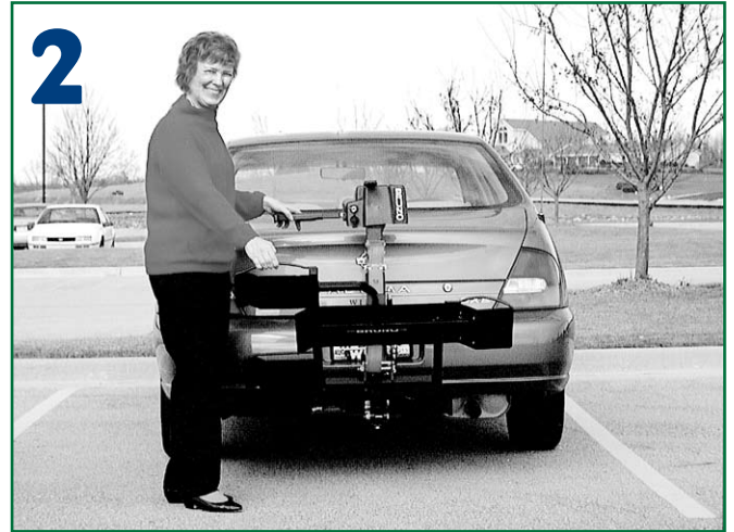
Lift lever and fold down platform.