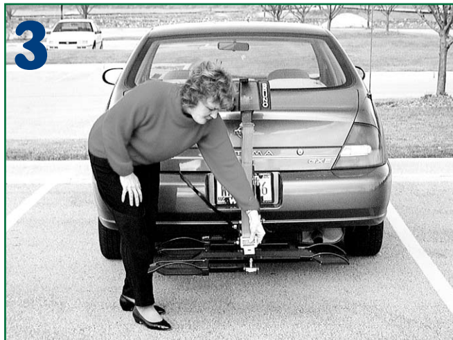
Unhook belt and loosen Velcro®*.