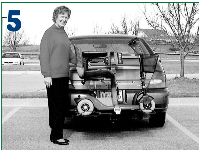
Roll scooter on platform, press switch to raise and secure with belt.